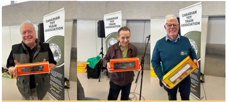
February Door Prize Winners