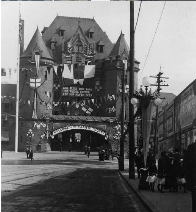
Vancouver's second CPR station