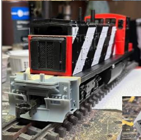
Left: Dan's loco with the 3D printed pilot (adjusted for large coupler)

One more go — to get tread plates on the steps (see nearest pair showing perforated treads — now that's detail!)