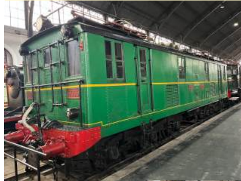
a Spanish Northern 3000V Alco/GE electric