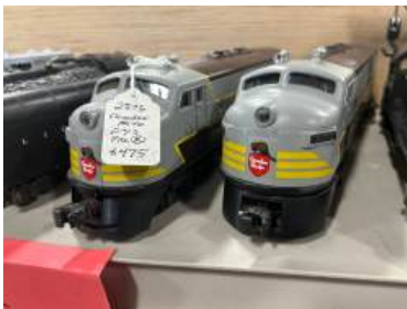
Yes there were modern trains too!