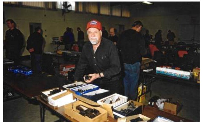
2. and 3. Horsing around at a monthly TTOS meet, Burnaby BC