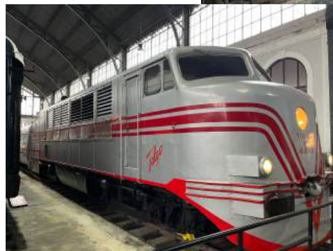
and a Talgo 3000V train set — loco built in Delaware, cars in Berwick PA