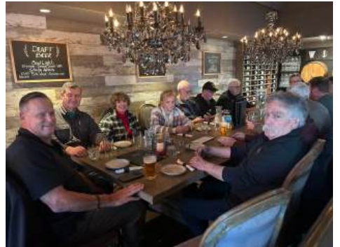
S. Acropolis Pizza, Everett

what a great CTTA bus trip, thanks to all organizers!