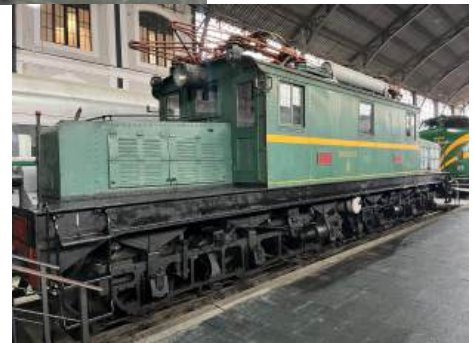
Another US-Built 3000V