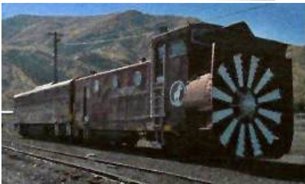
from the January newsletter of the South Shore Model Railroad Club & Museum, Hingham, MA