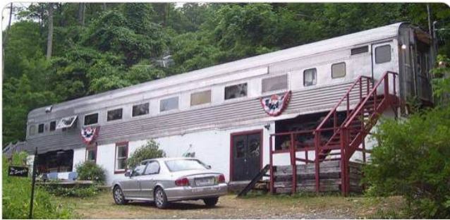
I Love Trains 1d

Train room upstairs and live downstairs?