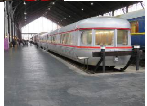
the last photo really shows how low-slung the talgo set is in comparison with the regular coach next to it.