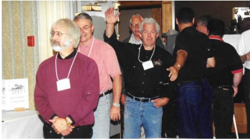
1. Opening lineup at the 2001 TTOS Convention in Vancouver