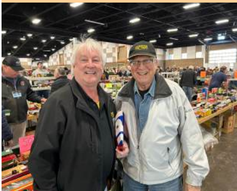
2. at the Great Train Show in Puyallup