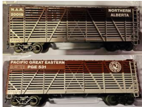
CTTA's cattle cars by Atlas.

fine photo of the carriage level access to the Niagara gorge suspension bridge completed in 1855, 14 years before the Brooklyn Bridge in NYC (same engineer). P.S. that's the Niagara Gorge the bridge is leaping across.